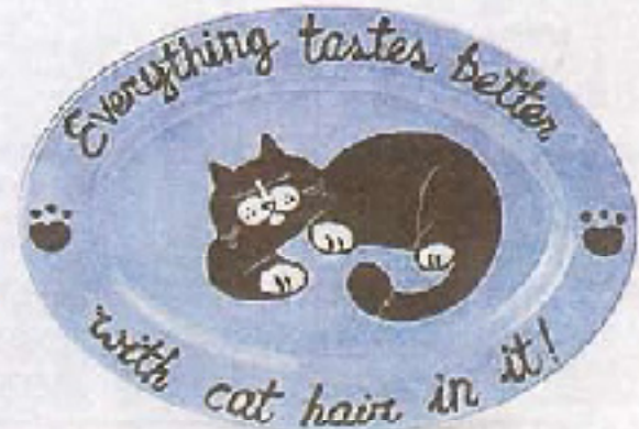
A blue cat platter for feline treats.