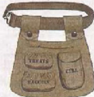
A carry case for busy dogs and their humans.

Fanny-packing. In this modern age, taking your dog for a walk requires all the accoutrements of a Napoleonic army camp. Seeking to make you fashionably organized, the Pawpular Pouch has compartments to stash leys, cell phone, doggy treats and poop-scooping baggies. The dog doesn't wear it, you do, which, admittedly, hardly seems fair. Available for $22.99 from pawpularpouch.com .