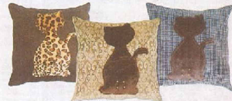
How about a Calsifier pillow, as in pacifier, get it? For kitties in need of something to suck on.

Ahoy, collie. Even before "Pirates of the Caribbean," skulls and crossbones were chic. Jolly Roger-themed collars, leashes and harnesses in both black and pink backgrounds are pretty much irresistible. Available for $50 for the set at trixieandpea.net.com . And if that's not enough buccanera bling for you, check out the crystal skull charms, at $35 each. Kitty pacifiers. Blanket-sucking is a hassle but relatively common problem among otherwise dignified felines who were separated from their mothers too soon and, lacking opposable thumbs, look for something else to satisfy their oral fixations. Enter the Calsifier, a seven-inch