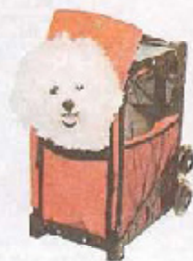
Zuca bags work well as carrying cases for small dogs.

Dog and cat carriers have always been with us — it's the zippy wheeled versions that are the newest twist. For little 'uns — up to 15 pounds — the Z226a pet carrier has a lot to recommend it, including a den-like atmosphere, an aluminum frame that doubles as a car seat, a removable heavy-duty fabric insert with mesh panels for ventilation and visibility, side pockets for stashing treats and sanities, and a quad wheel system that climbs stairs. (The carriers are not, however, airline safe.) Available for $150 from Nordstrom, or visit zucac.com for more retailers.