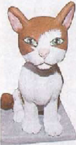
Put your dog or cat on the dashboard at bobbypets.com

Bye, bye, birdies. Central Park has a share of unusual birds. Pale Male the red hawk, least of all. "In the Cathedra Seat," a new feline-centric "natural sound documentary" on DVD, captures some less fearsome feathered folk for your cat's viewing pleasure, from Canada geese to pigeons to even a white egret. Available for $14.95 from splitmilkproductions.com . Bubblenecking delay. Bobbleheads aren't just for dashboards anymore. Capitalizing on the resurgence of these kitschy nothings, bobbypets.com can create a spookily realistic bobble version of your favorite dog or cat. ( caveat: Unless you're willing to pay primo for rush delivery, these cannot be ordered in time for the holidays.) Available in two sizes — regular ($134.95) and mini ($79.95) — these custom bobbleheads also can be made to resemble the human of your choice.